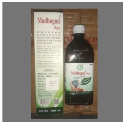
Madhugud Ras 500ml