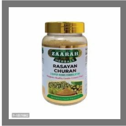
RASAYAN CHURNA 100gm