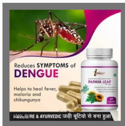
Papaya Leaf Capsules