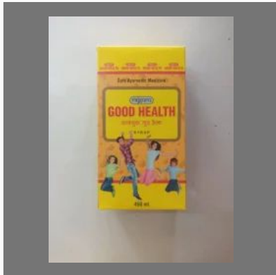
GOOD HEALTH SYRUP 450 ml