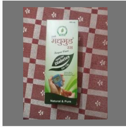
Antidiabetic madhugud ras