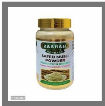
SAFED MUSLI POWDER 100gm