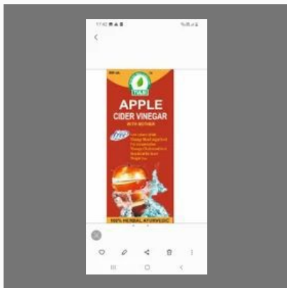
APPLE CIDER VINEGAR 500ml