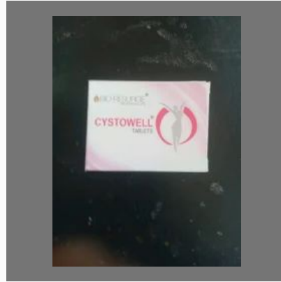
Cystowell PCOD tablet