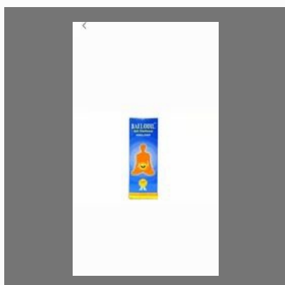
IBS and Colitis syrup