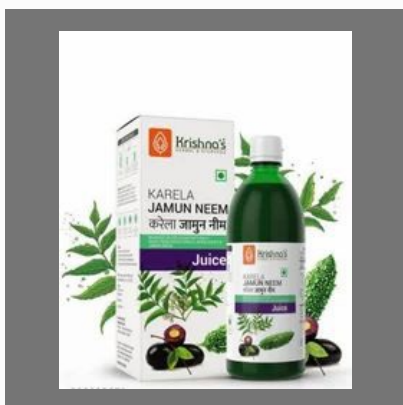
Neem Karela Jamun Juice