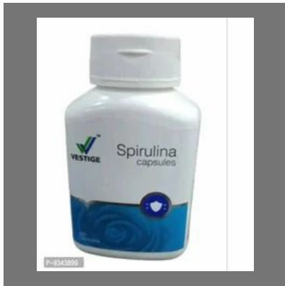
Vestige Spirulina Capsules 100 Capsules