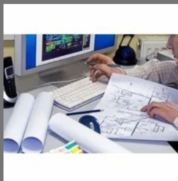
Engineering Consultancy Service