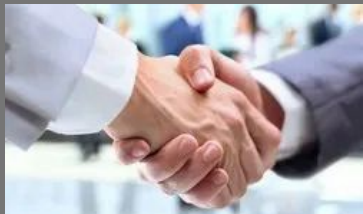
SPM Machine Designing Service