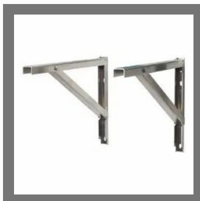
AC Wall Mount Bracket