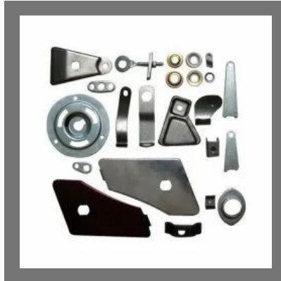
Precision Pressed Component Service