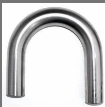
CNC Pipe Bending Service