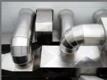
Bending And Shearing Service