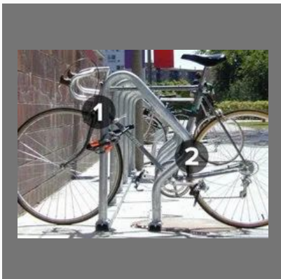
Mild Steel Bicycle Stand