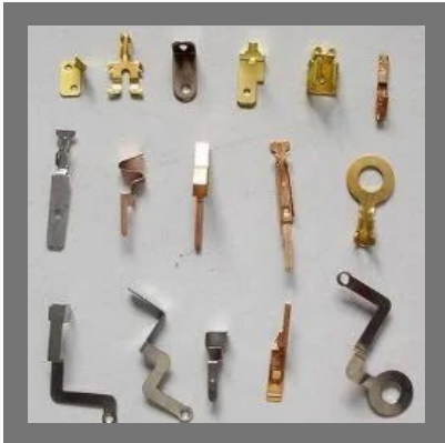
Assembly Pressed Component Job Work Service