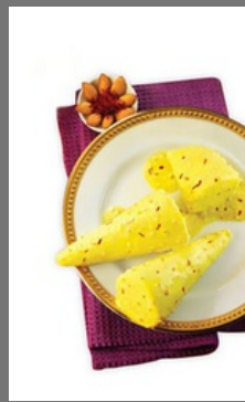
Kulfi Kesar Badam