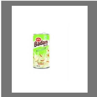
Cardamom Badam Milk Drink