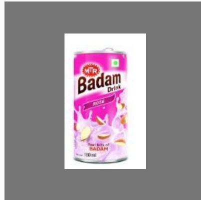
Rose Badam Drink