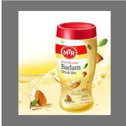
Adam Drink Mix