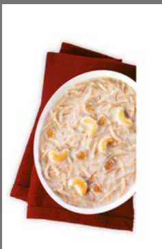
Vermicelli Payasam Or Seviyan Kheer