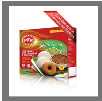
Idli Vada With Sambar And Chutney