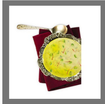
Basundi Or Rabdi