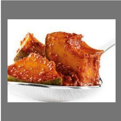
Mango Avakai Pickle