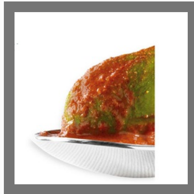
Mango Full Tender Pickle