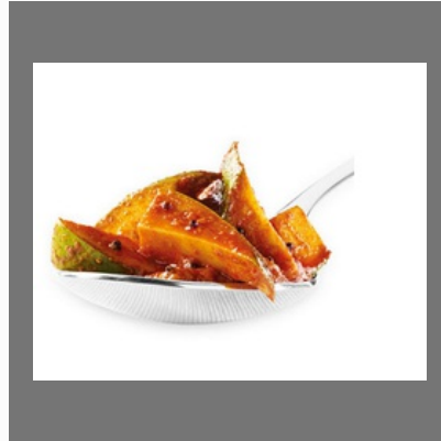
Mango Sliced Pickle