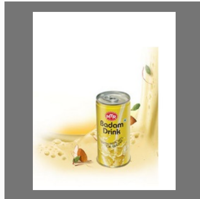
Badam Drink Milk