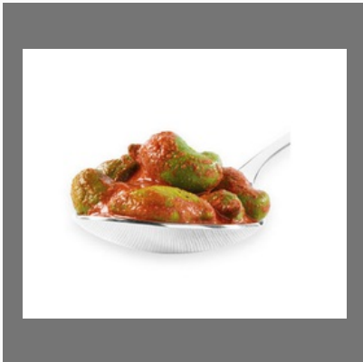
Mango Full Jar Appemindi