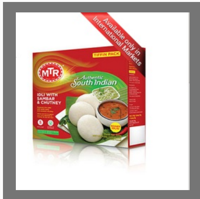
Idli With Sambar And Chutney