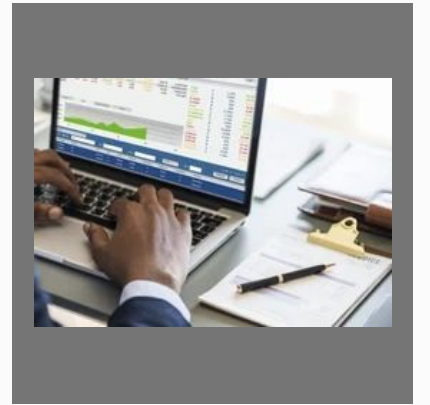
Monthly Accounting Services