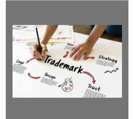
Trademark Registration Services