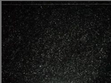
Sparkle Black Stone