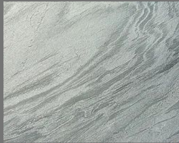
Silver Grey Brushed Finish