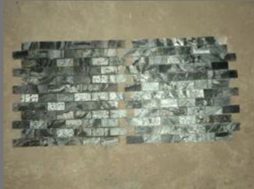
Stoner Art & Craft