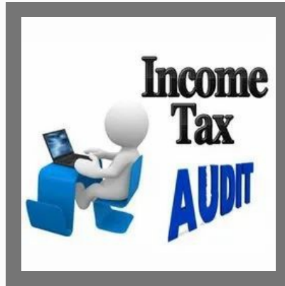
Tax Audit Service