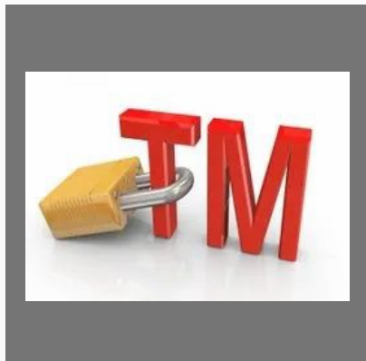
Trademark Registration Service