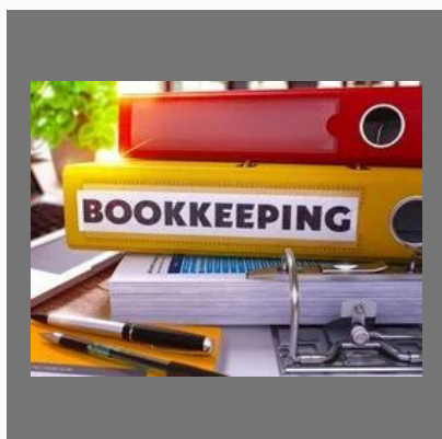
Accounts Preparation Bookkeeping Service