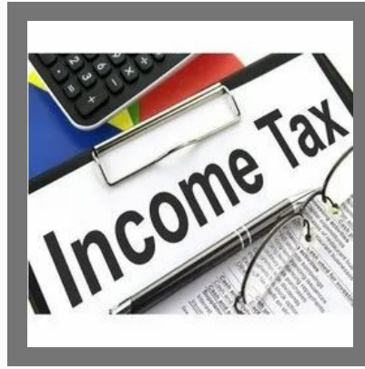
Income Tax Consultant