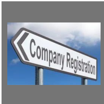
Company Registration Service