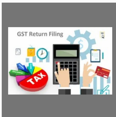
GST Return Filing Service