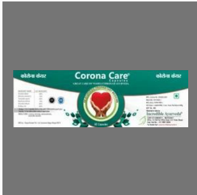
Corona Care Capsules