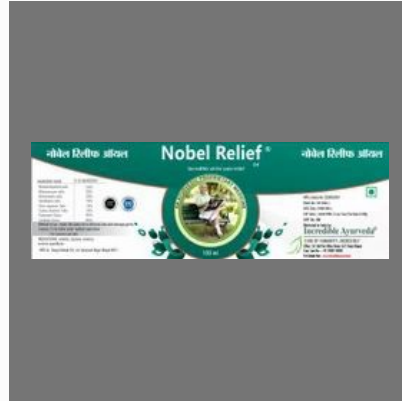
Nobel Relief Oil