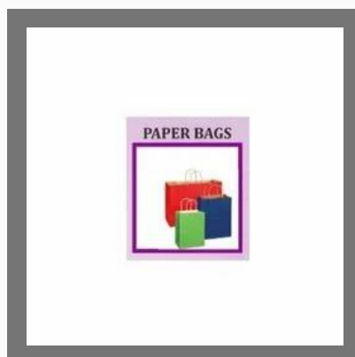
Disposable Paper Bags