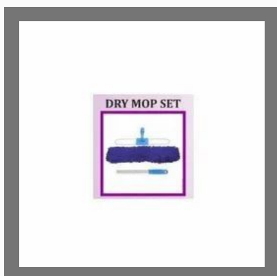
Dry Mop Set