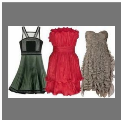
Ladies Tunic Dress