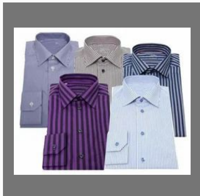
Formal Men's Shirts