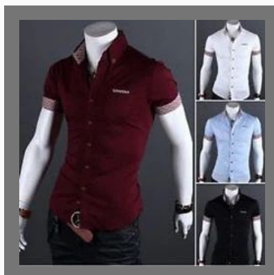
Half Sleeves Men's Shirt