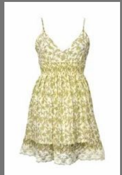
Ladies Short Dress