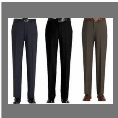
Men's Formal Trouser