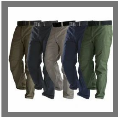
Casual Cotton Pants