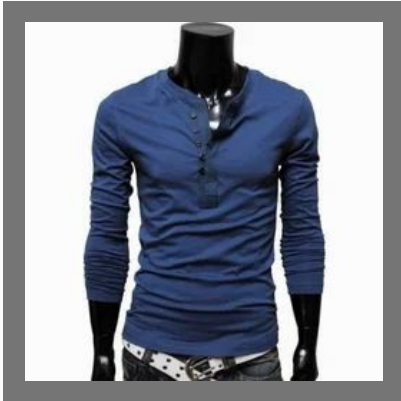
Full Sleeves T-Shirt