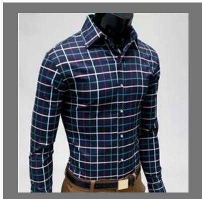
Check Full Sleeves Shirt