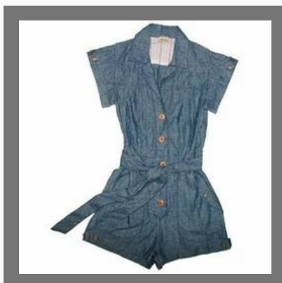
Short Jump Suit