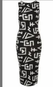
Ladies One Piece Dress