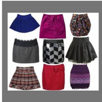
Short Stylish Skirts