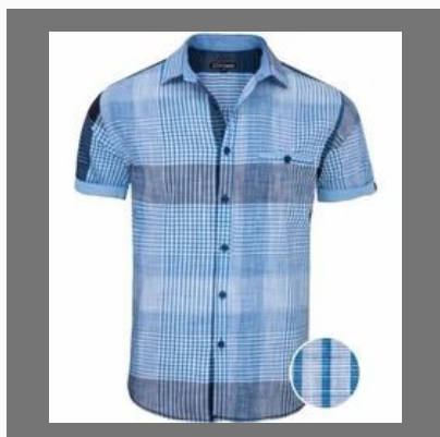
Half Sleeves Cotton Shirt