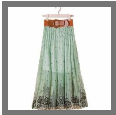
Long Stylish Skirts