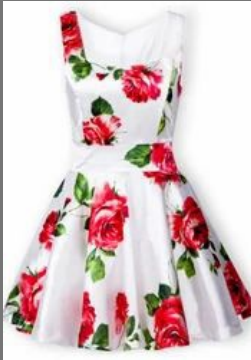
Ladies Floral Dress