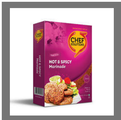
Hot & Spicy Marinade