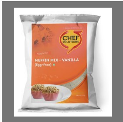
Muffin Mix (Egg-Free) Vanilla