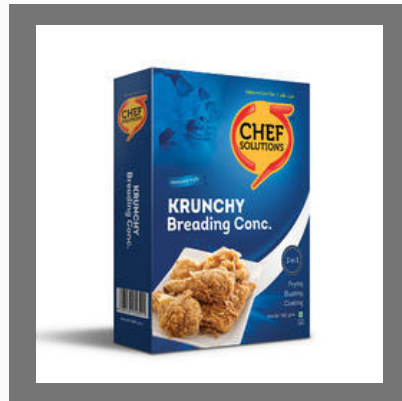
Krunchy Breading Conc