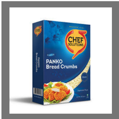
Panko Bread Crumbs - 8mm (European Style)