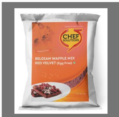
Belgian Waffle Mix (Egg-Free) Red Velvet