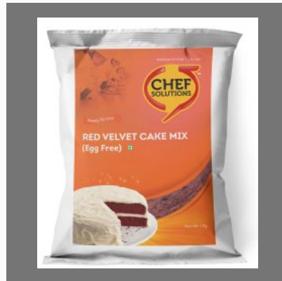
Red Velvet Cake Mix (Egg-Free)