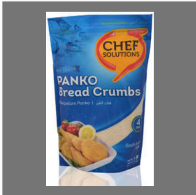
Panko Bread Crumbs - 4mm (South Asian Style)