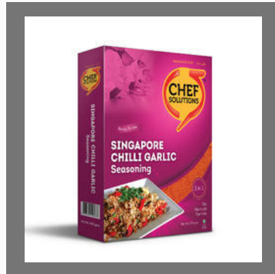
Singapore Chilli Garlic Seasoning