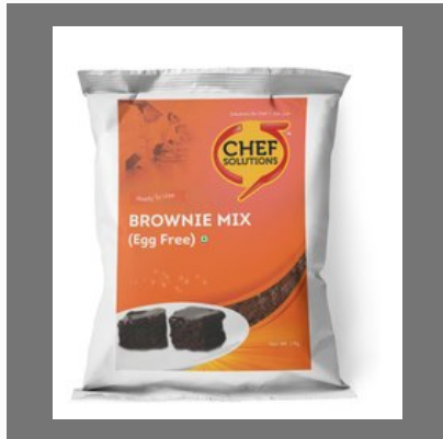
Brownie Mix (Egg-free)