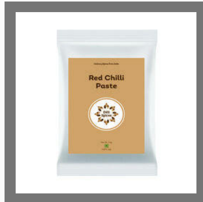
Red Chilli Paste