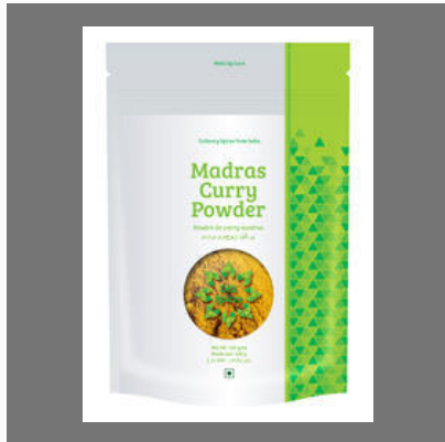
Madras Curry Powder