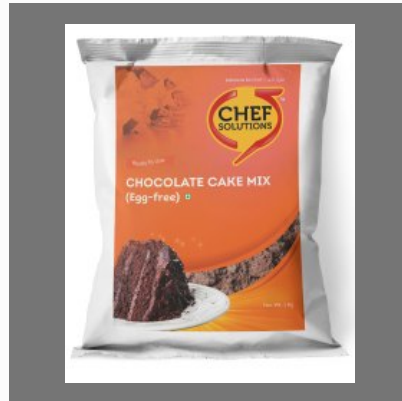
Chocolate Cake Mix (Egg-free)