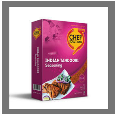
Indian Tandoori Seasoning