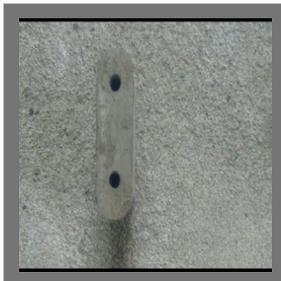
Plastic Moulding 1