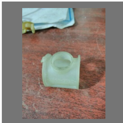
Electronic Plastic Component