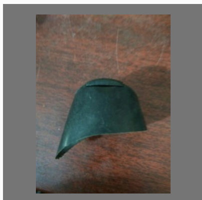
Pet Preform Mould