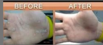
Laser for Warts