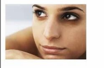
Dark Circle Treatment