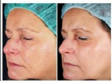
Fractional CO2 Laser For Acne Scarring and Anti-Aging