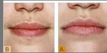
Laser Hair Removal