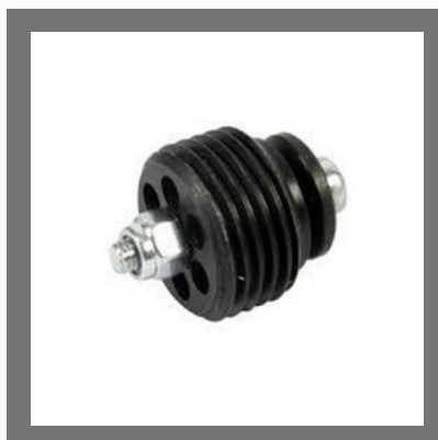
Bosch Rexroth - Hose Burst Valve