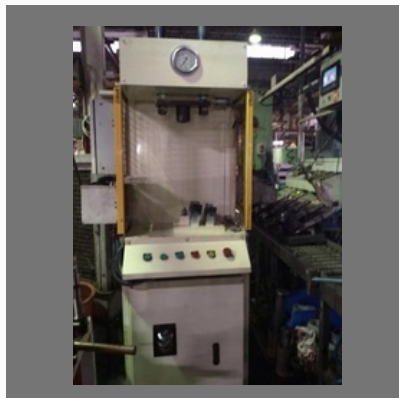
Hydraulic Press Machine