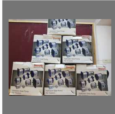
Mahindra Tractor Gear Pump