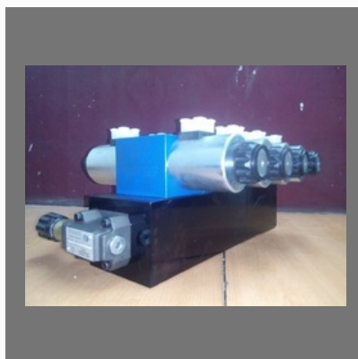
Hydraulic Manifold Block