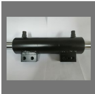
Power Steering Cylinder