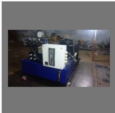
Hydraulic Power Pack