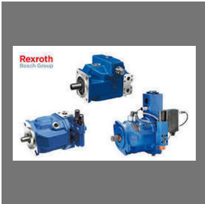
Bosch Rexroth Pump