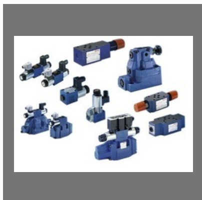
Rexroth Bosch - Hydraulic Valve