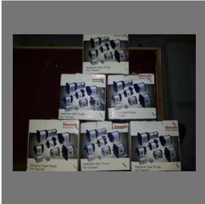
Swaraj(PTL) Tractor Pump