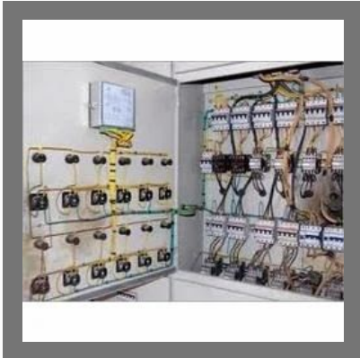
Electrical Control Panels