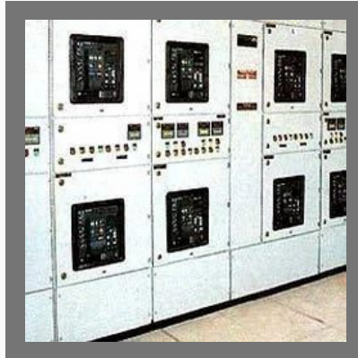
HT Control Panel