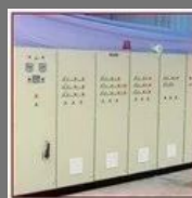
Electric Control Panel Boards