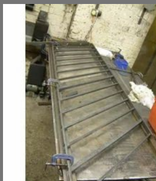
All Type Metal Jobs