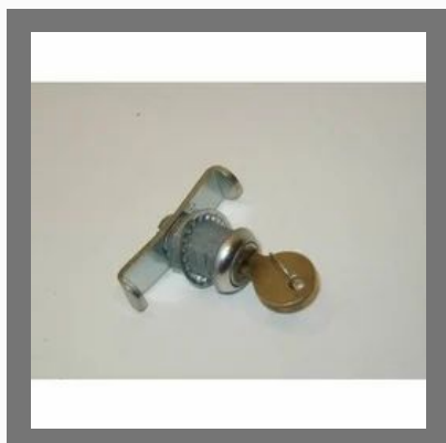
Metal Boxes and Enclosures