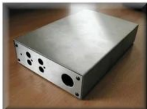
Sheet Metal Instrument Boxes