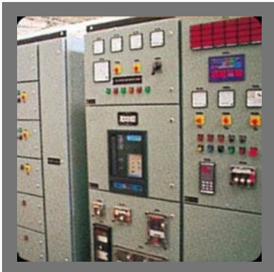
LT Control Panel