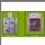
Automatic Electric Control Panel