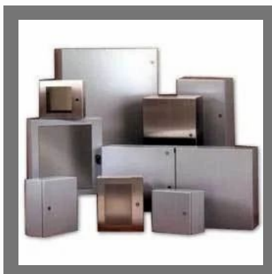
Control Panel Enclosures