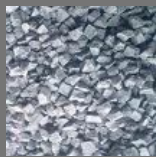
Silico Manganese- M.C. Silico Manganese