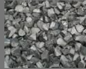
Ferro Manganese- H.C Ferro Manganese (Low Phos)