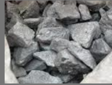
Ferro Silicon- Ferro Silicon (Normal Al.)