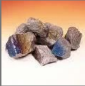
Ferro Manganese- H.C Ferro Manganese