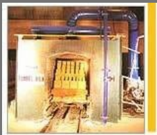
Insulation Castables & Mortars