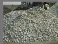
Silico Manganese- H.C Silico Manganese