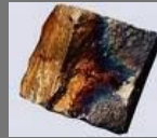
Silico Manganese- H.C Silico Manganese (Low Phos)