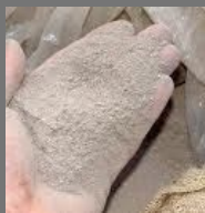
Fireclay & High Alumina Mortar