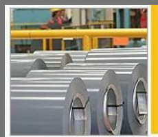
BMA Stainless Ltd