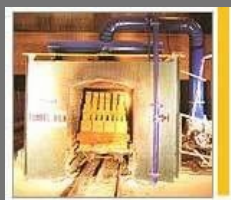
Insulation Bricks and Refractory Bricks