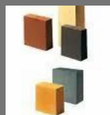
Alumina Silicate Bricks- High Alumina Bricks