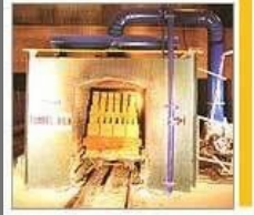
Special Insulation Bricks