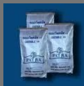
Fireclay & High Alumina Castables