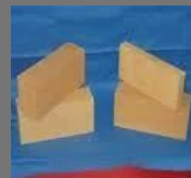
Insulation Castables & Mortars