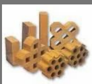
Fireclay & High Alumina Ramming Masses