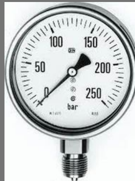
Stainless Steel Pressure Gauge