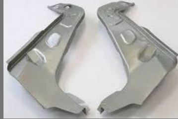
Sheet Metal Dies