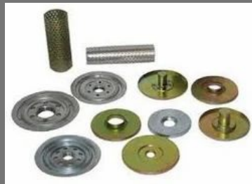
Precision Sheet Metal Components