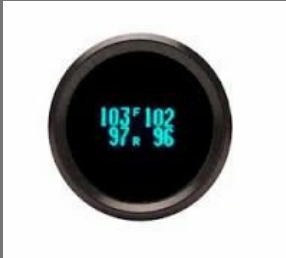
Digital Pressure Gauge