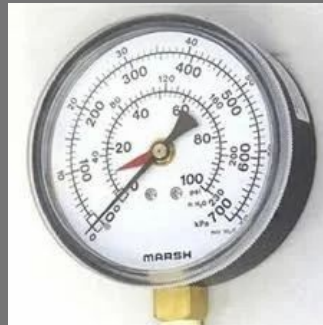
Compound Pressure Gauges