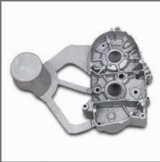
Aluminium Die Casting