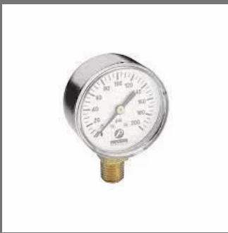
Air Pressure Gauge