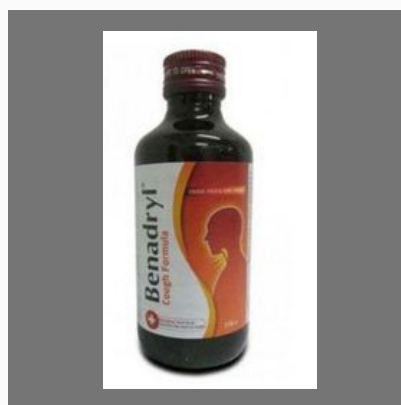
Benadryl C Formula Syrup