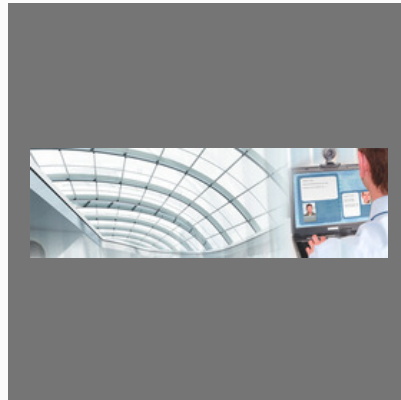
Live Chat Support