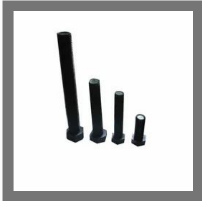
Hex Head F.T. Bolts