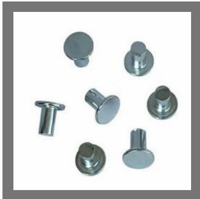
Flat Head Rivets