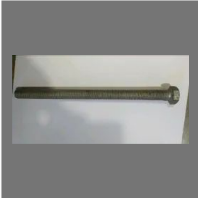
Full Thread Bolt