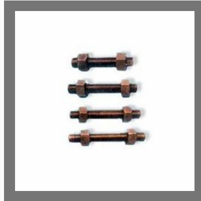
Full Thread Stud