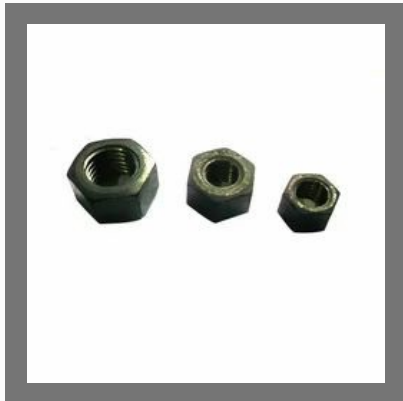
Hex Black Nuts