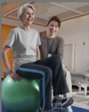
Old Age Home Services and Rehabilitation Center