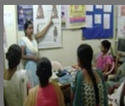
Vocational Nursing Training