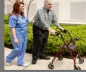
Special Nursing Care