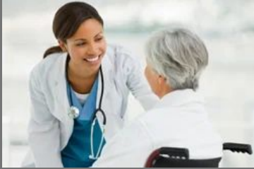
Nursing Care Taker