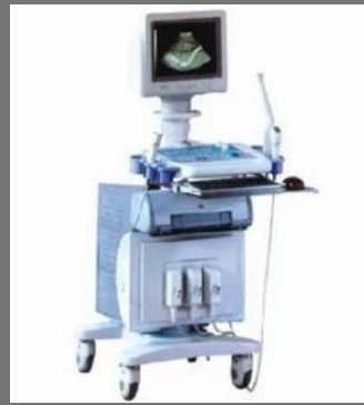
Medical and Surgical Equipments for Rent