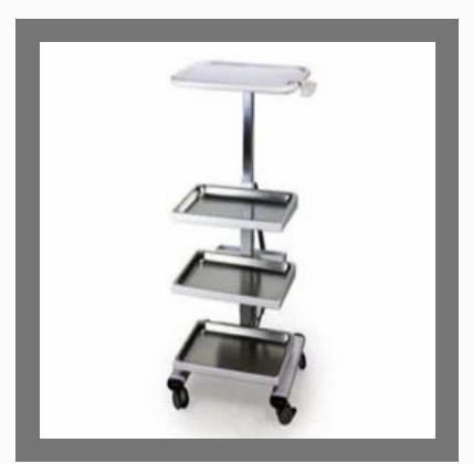
Dental Trolly Stand