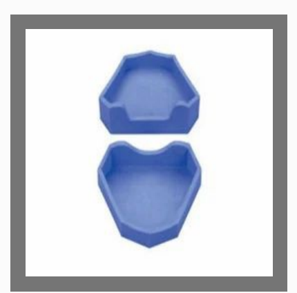
Dental products Alpine Base Former