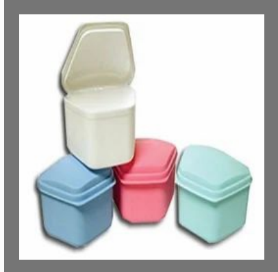
Dental Denure Box