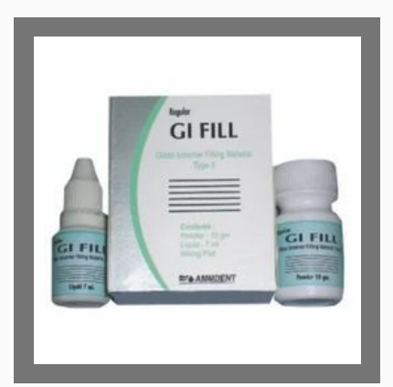
REGULAR GI FILL