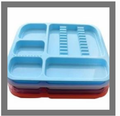
Dental Instrument Tray