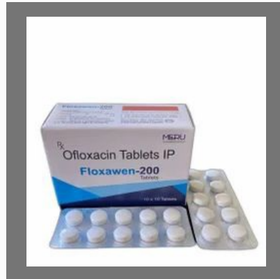
200mg Ofloxacin Tablet