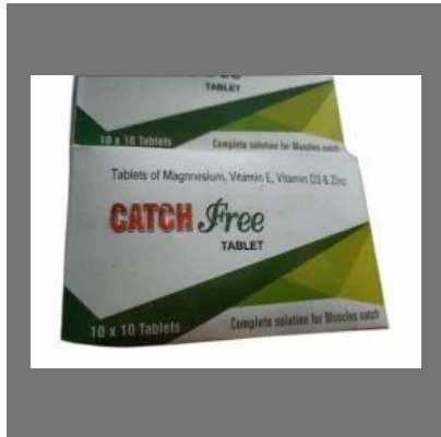
Magnesium Zinc Tablet