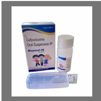
Cefpodoxime Oral Suspension IP