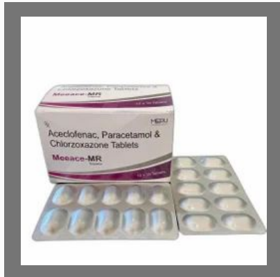
Aceclofenac Paracetamol Chlorzoxazone Tablet