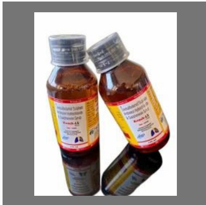
100ml Knock LS Cough Syrup