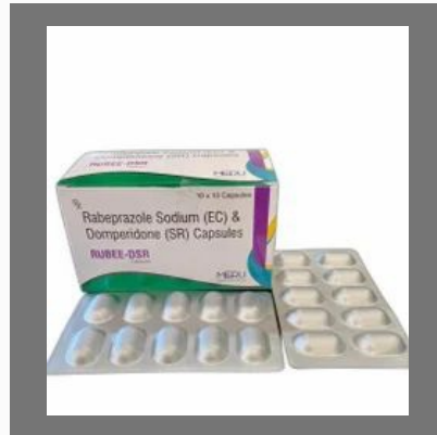
Rabeprazole Sodium Domperidone Capsules