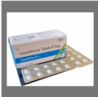
Levocetirizine Tablet IP