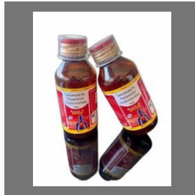
100ml Knock D Cough Syrup