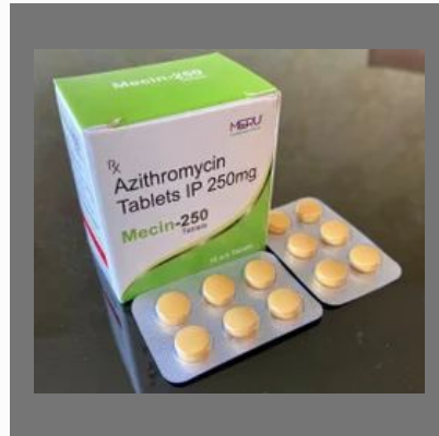
Azithromycin 250mg Tablets