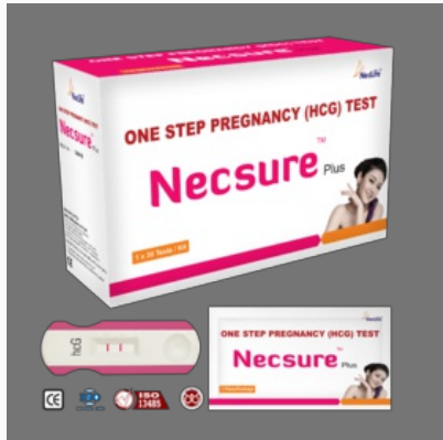
Necsure Plus Pregnancy Test