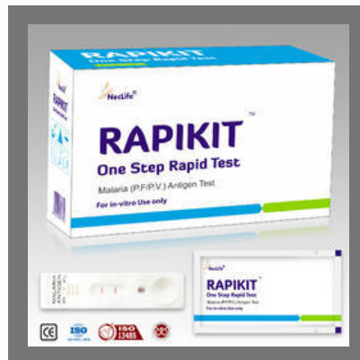
Malaria Antigen Test Card