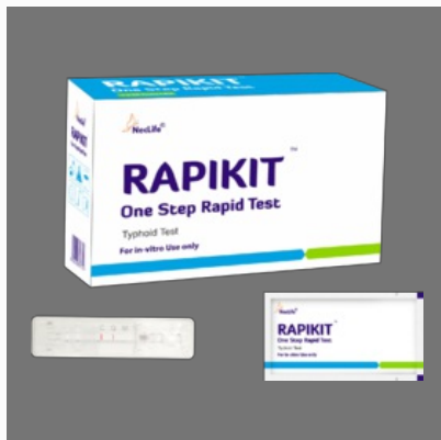
Typhoid Rapid Test Device