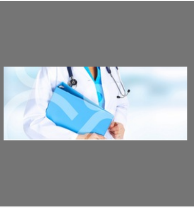
Heavy Or Irregular Periods Treatment Service