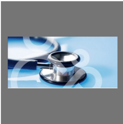
Heavy Painful Periods Treatment Service