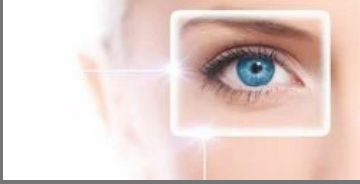
Retina Treatment Service