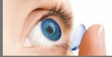
Contact Lens Treatment Service