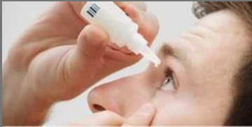
Cornea Treatment Service