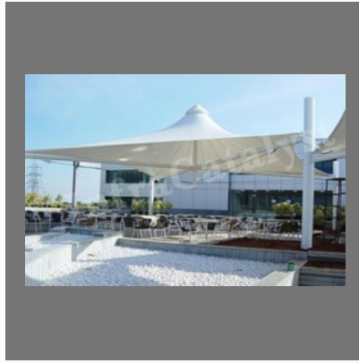
Awning And Canopy