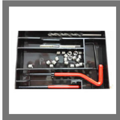
Thread Repair Kits