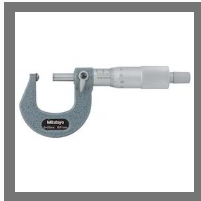
Precision Measuring Instruments