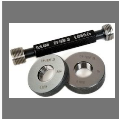
Thread Ring Gauges