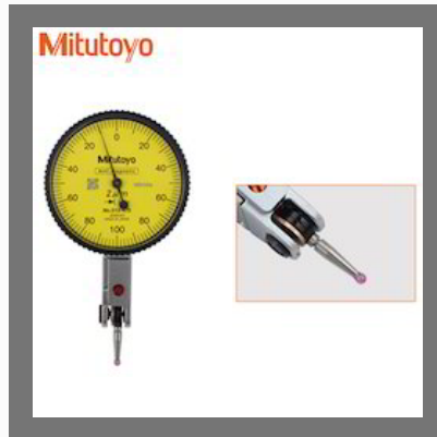
Lever Dial Gauge