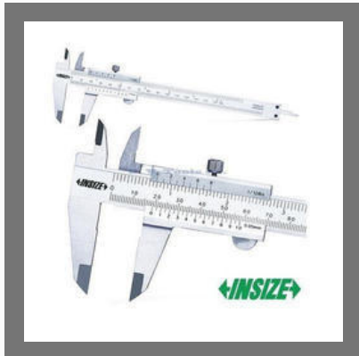
Insize Measuring Instruments