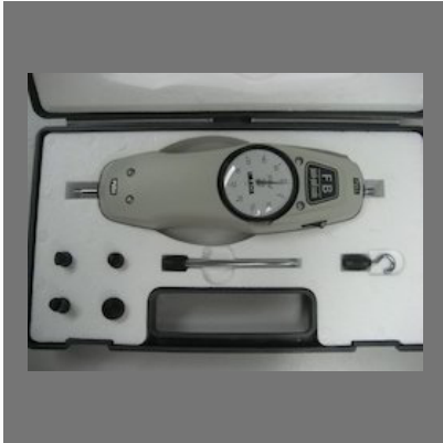
Push Pull Gauge