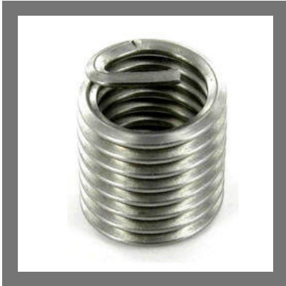
Helicoil Thread Inserts