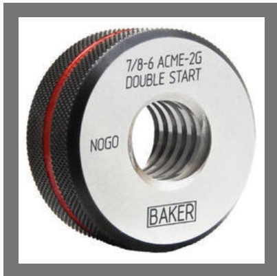
Thread Ring Gauge