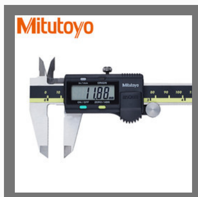
Mitutoyo Measuring Instrument