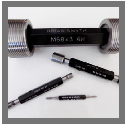
Size Control And Baker Thread Gauges