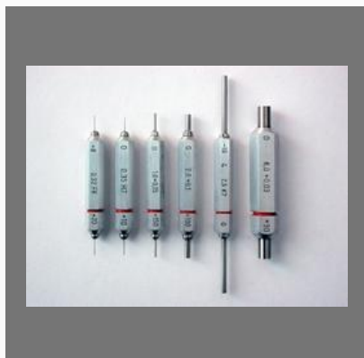
Plain Plug And Ring Gauges