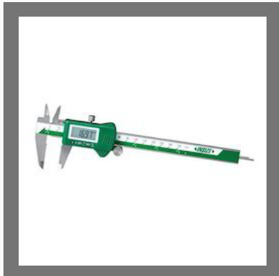
Digital Vernier Caliper