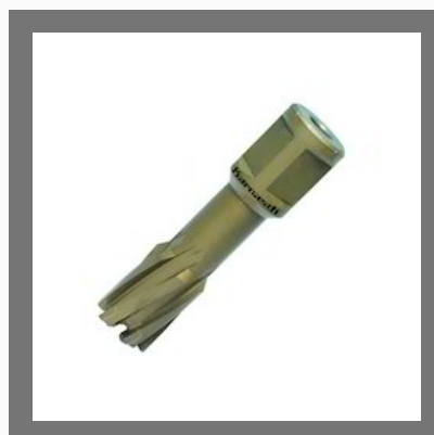
Karnasch Broach Cutters