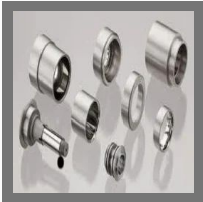
High Precision Machine Components