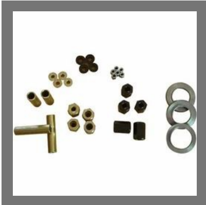
Precision Auto Components