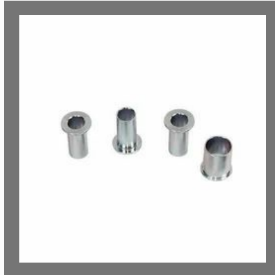
Precision Turned Components