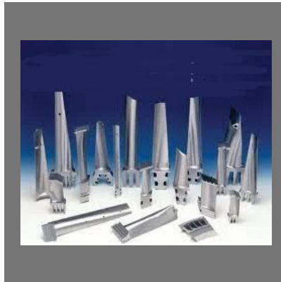
Turbine Blade Precision Machined