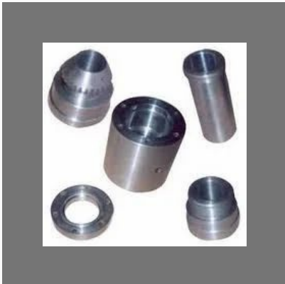
Precision Machined Works