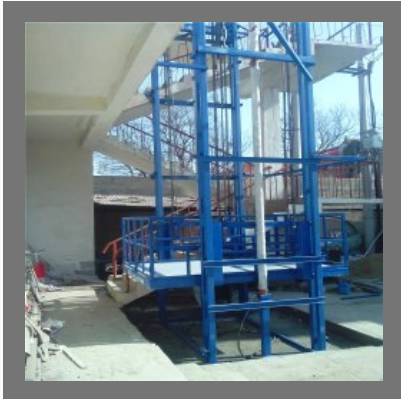
Goods Flip Loading lift