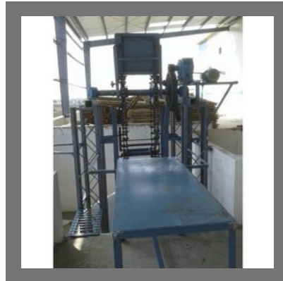
Industrial Cold Storage Vertical Lift