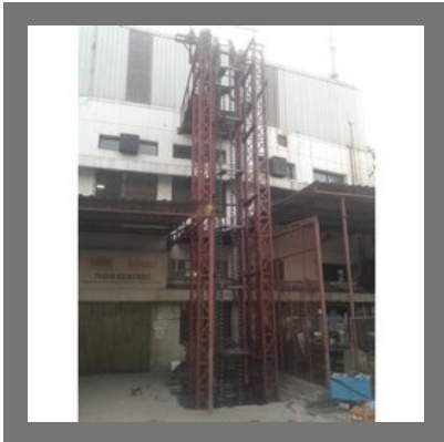
Cold Storage Vertical Lift