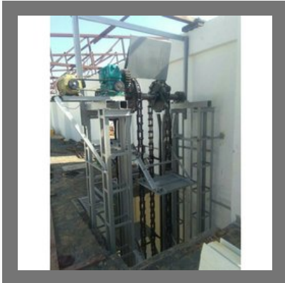
Mild Steel Cold Storage Vertical Lift