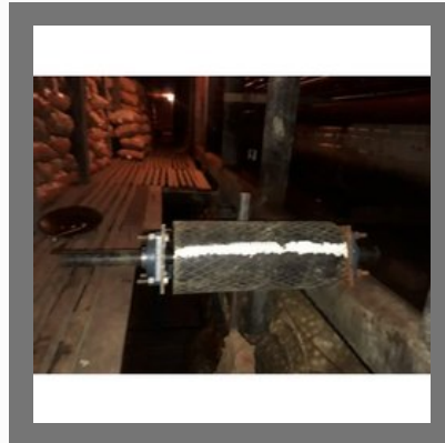
Industrial Belt Conveyors