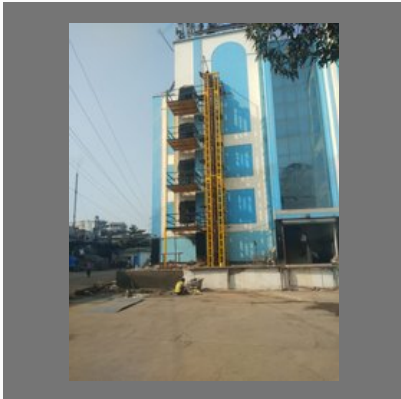
Cold Store Lift