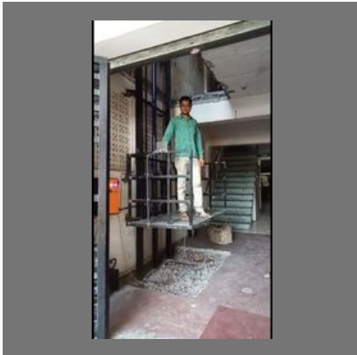
Hydraulic goods lift