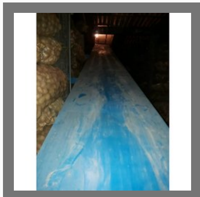
Cold Storage Belt Conveyor