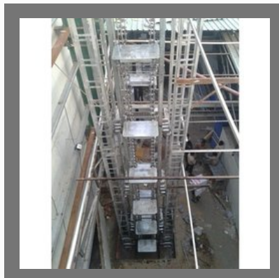
Cold Storage Lift