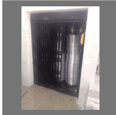
Stainless Steel Goods Cum Passenger Lift