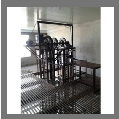
Automatic Cold Storage Vertical Lift