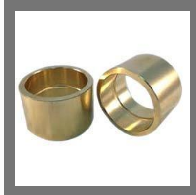
Phosphorus Bronze Bush Casting