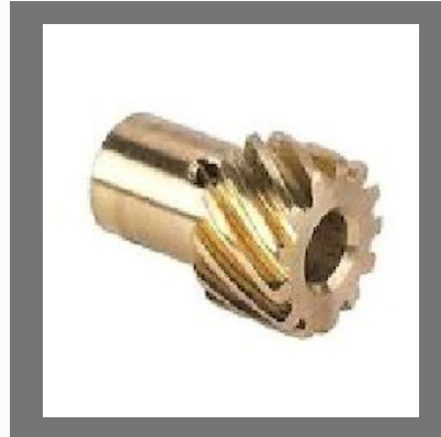
Aluminium Bronze Graded Casting