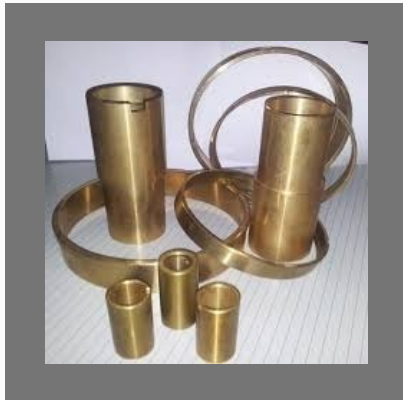
Gun Metal Casting