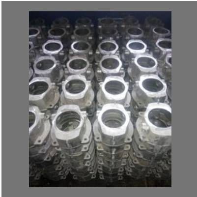
Aluminium Gravity Casting