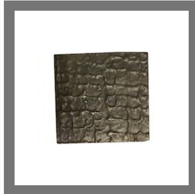
Aluminium Moulds Casting