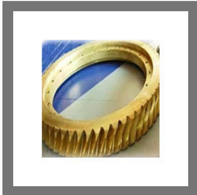
Aluminium Bronze Gear Casting