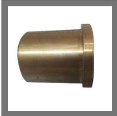
Aluminium Bronze Casting