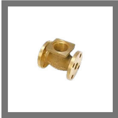
Gun Metal Valve Casting