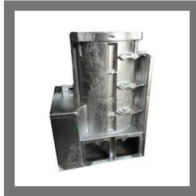
Aluminium Alternator Body Casting