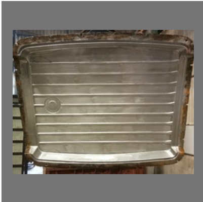
Aluminium JCB Roof Mould