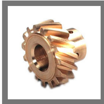
Phosphorus Bronze Gear Casting