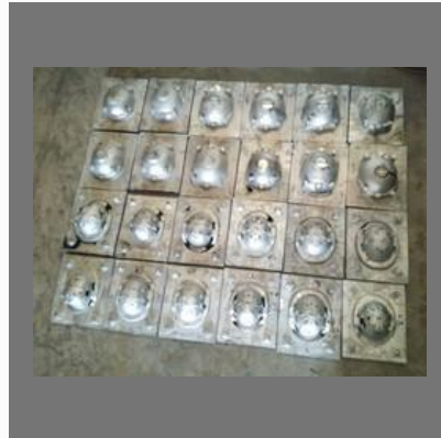
Aluminium Helmet Mould