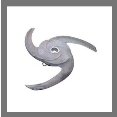
Aluminium Gravity Die Fan Casting