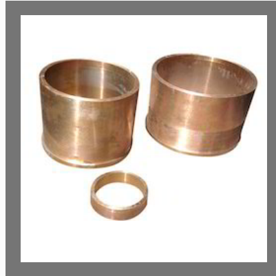
Bronze Machined Bush Casting