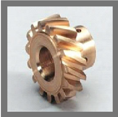
Phosphorus Bronze Graded Casting