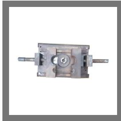
Gravity Die Mould Casting