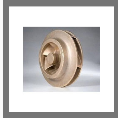
Gunmetal Big Impeller Casting