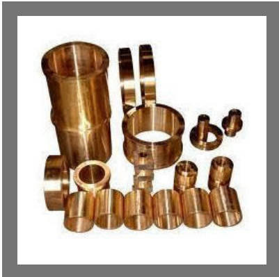
Phosphorus Bronze Casting