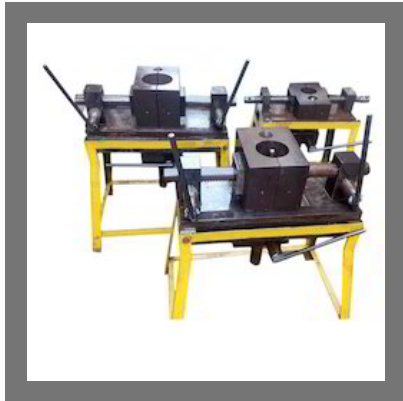
Gravity Die Casting