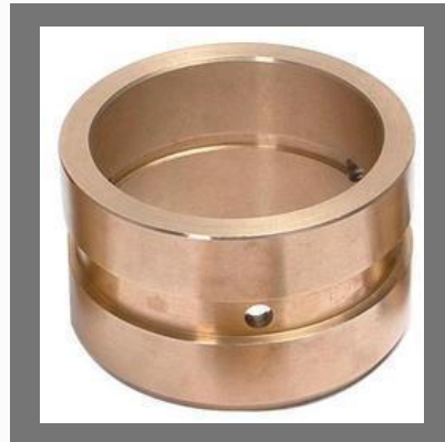
Gun Metal Bush Casting