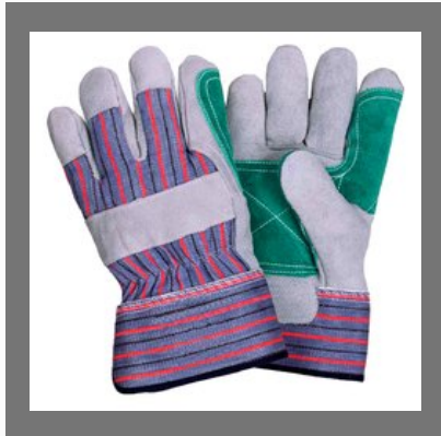
Canadian Double Palm Safety Gloves