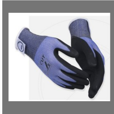
Cut Protection Gloves