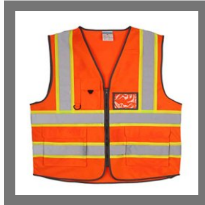
Reflective Safety Jackets