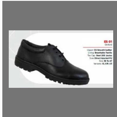
ES 01 Sports Shoes