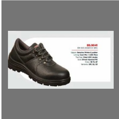
BS 9041 Sports Shoes