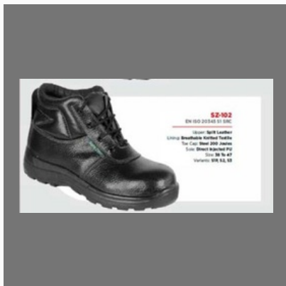
SZ-102 Sports Shoes