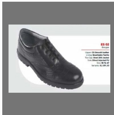
ES 02 Sports Shoes