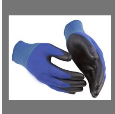
Thin Working Gloves