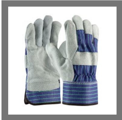
Canadian Single Palm Safety Gloves