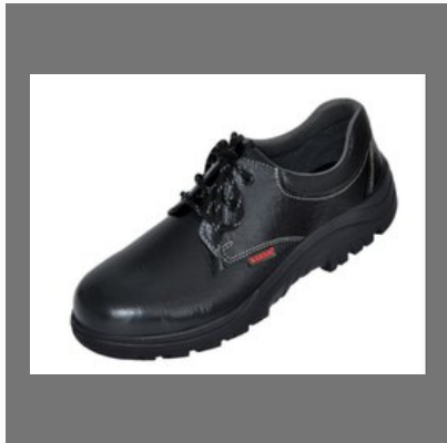
Single Density Sole Safety Shoes