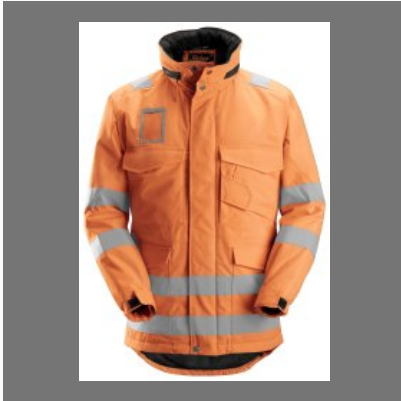
Reflective Winter Jacket