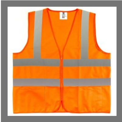
Reflective Safety Jackets