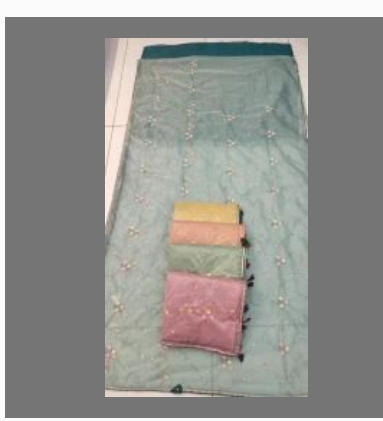
Designer Saree Fabric