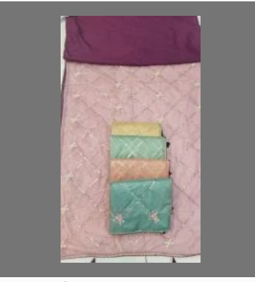
Fancy Saree Fabric