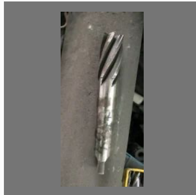
Carbide End Mills