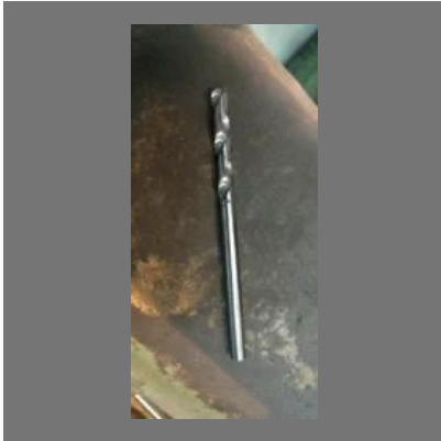
Wood Drill Bit