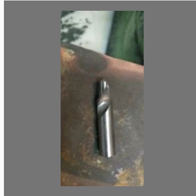
Carbide End Mills