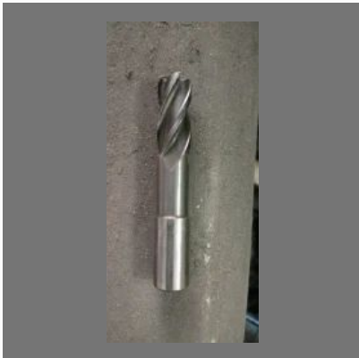
Carbide End Mill