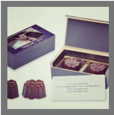
Fruit and Nuts Chocolate