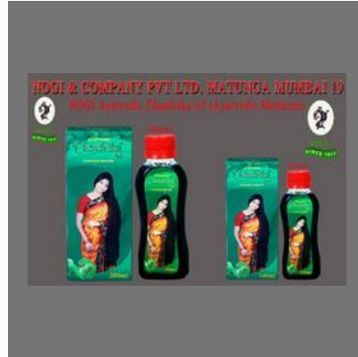
Brahmi Conditioning Oil Product