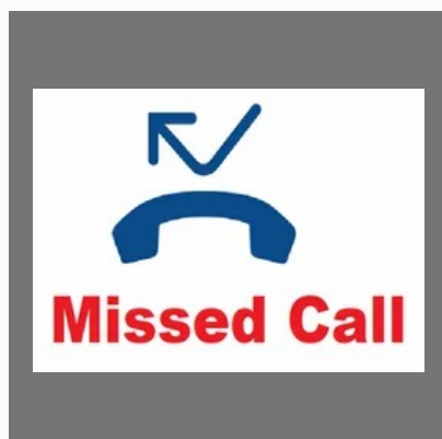
Missed Call Alert Service