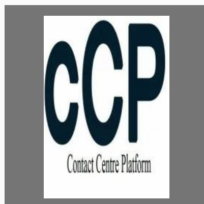
Contact Center Solution