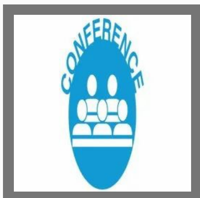
Multipoint Audio Conferencing Solution