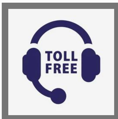
Toll Free Number Service Provider