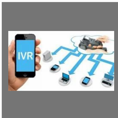
Interactive Voice Response Systems