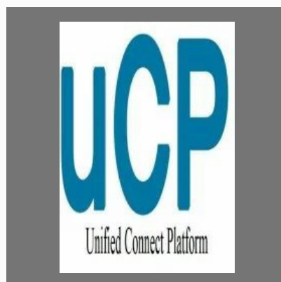
Unified Communications Platform