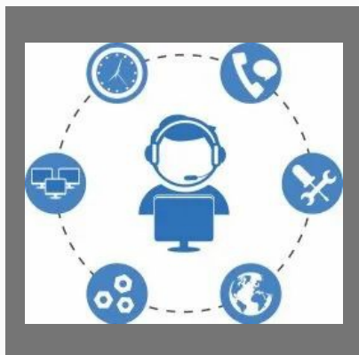
Call Center Setup Services