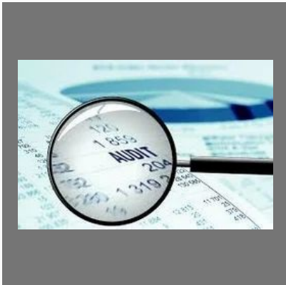
Account Auditing Services