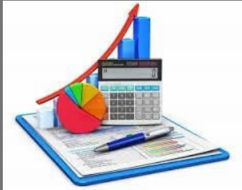
Financial Advisory Service