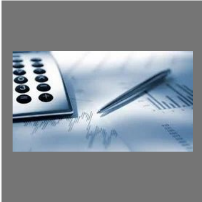
Chartered Accounting Services