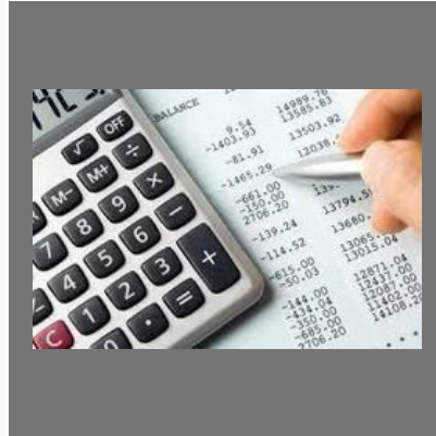
Financial Accounting Services