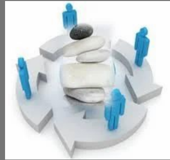
Financial Management Services