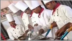
Basic Training Kitchen