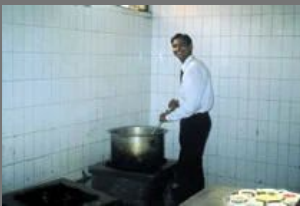
Quantity Training Kitchen