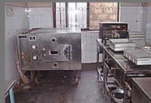
Bakery Training Kitchen