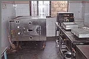
Bakery Training Kitchen