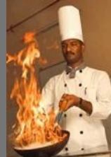
Advanced Training Kitchen