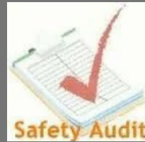
Safety Audits Services