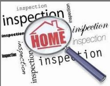
Supplier Third Party Component and product Inspection Services