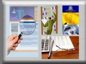
Department Functional Process and Product Audit Services