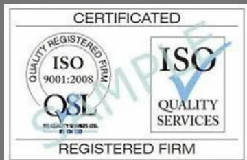
ISO 9001 Training and Consultancy Services