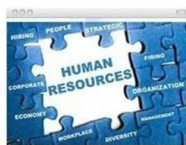
HR Department Placement Services