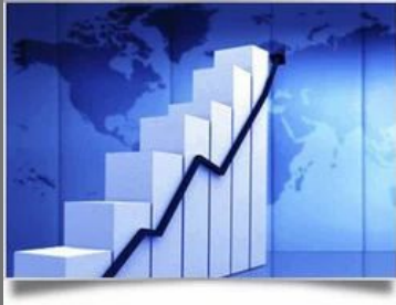
Shares trading and investments Training Services