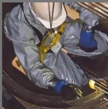
Visual Testing Services