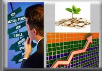
Shares Trading and Investment Training Services