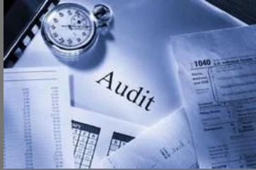
Supplier and Component Evaluation , Development and Audit Service