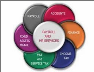
Business Audit Services