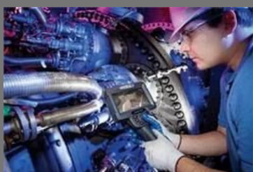
NDT Inspection Services