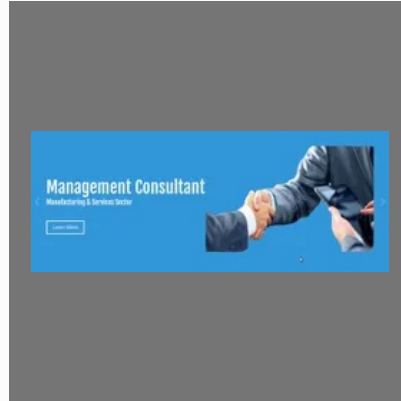
Management Consultant Service