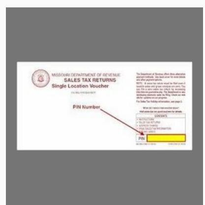
Sale Tax Number