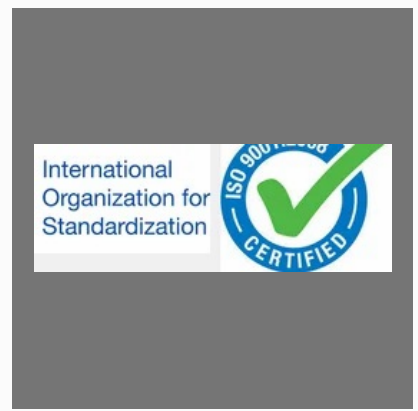
ISO Certification Consultancy