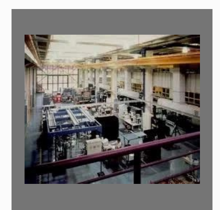
Manufacturing and Research Services