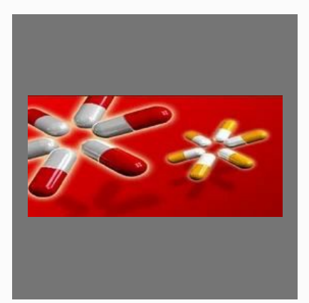
Nonsteroidal Anti inflammatory Drugs