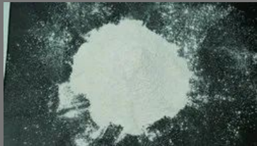
Light Calcined Magnesite Powder For Millstone