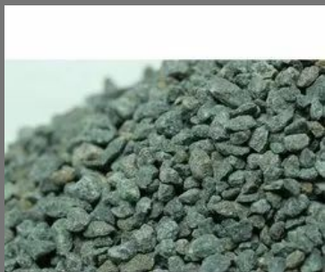
Olivine EBT Filling Mass