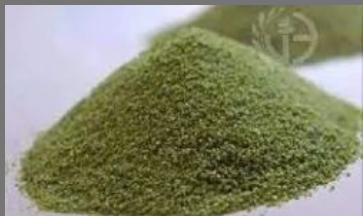
Olivine Sand Foundry Grade