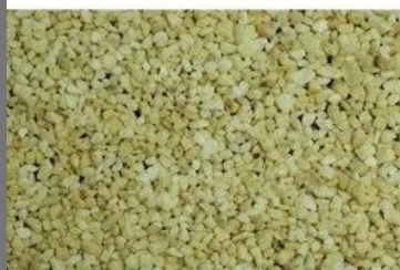
Dead Burnt Magnesite