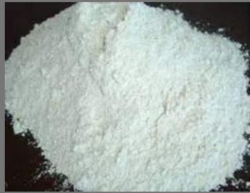
Light Calcined Magnesite