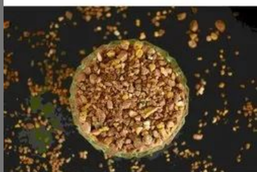
Dead Burnt Magnesite