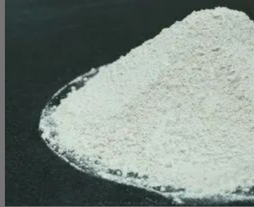
Magnesium Oxide Powder