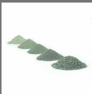
Olivine Sand Refractory Grade