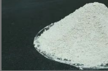
Calcined Magnesite Powder