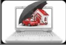
General Insurance Service