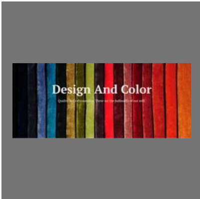
Innovative Designs and Vibrant Colors