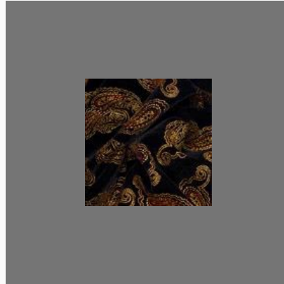
Metallic Print Velvet