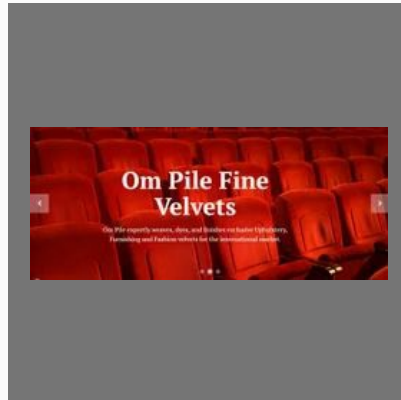
Fine Velvet Dyes