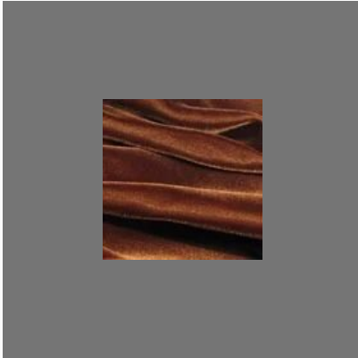
Rayon / Viscose Staple Velvet