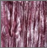
Rayon Crush Velvet