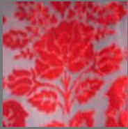
Burnt Out Velvet