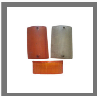
Car Light Cover