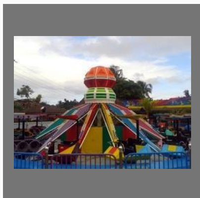
Amusement Mini Jet Ride