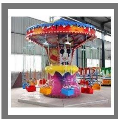
Amusement Mini Swing