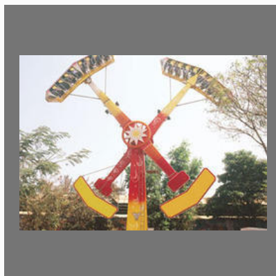
Amusement Train Rides