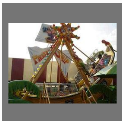
Amusement Pirate Ship Ride