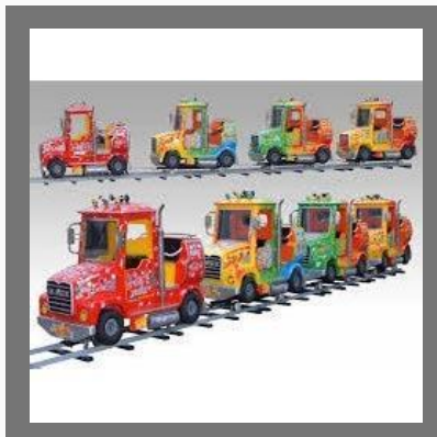
Amusement Track Train