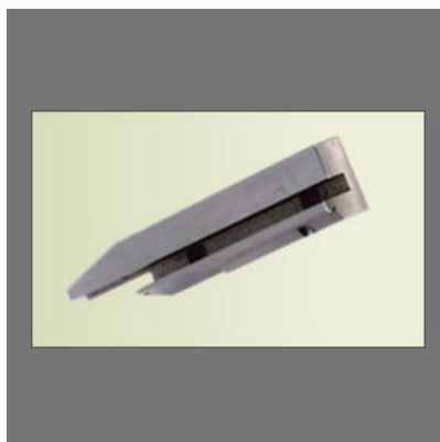
Elevator Guide Rails