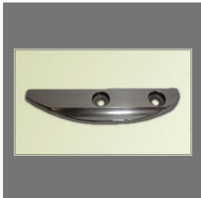
Projectile Lifter Upper Part M.S. D - 1