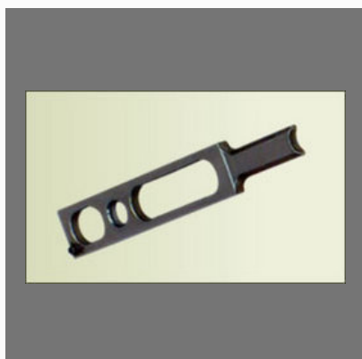
Projectile Returner Heavy