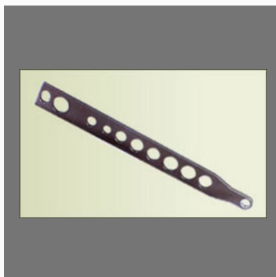
PROJECTILE FEEDER DRIVE R.H. Lever D-1 TW 11