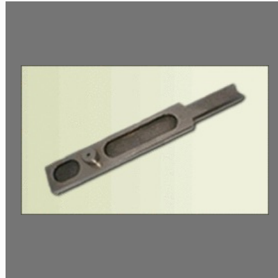
Projectile Returner D - 2