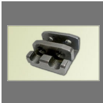
Conveyor Link D-1