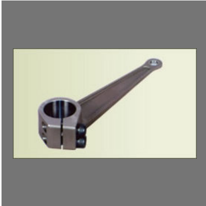
PICKING MECHANISM Picking Lever D -37