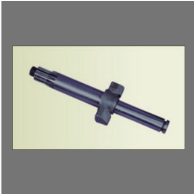
Splined Shaft T.W.11