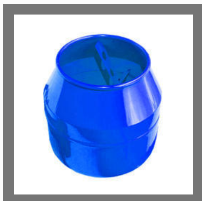
Half Bag Concrete Mixer Drum