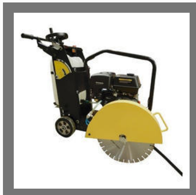
5 HP Concrete Cutter