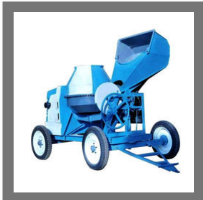
Tilting Drum Concrete Mixer with Hydraulic Hopper