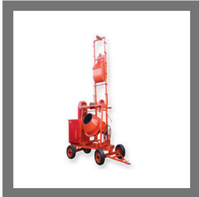
Concrete Lift Mixer Machine