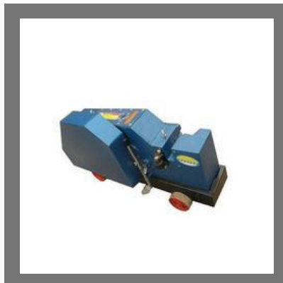
Steel Bar Cutter