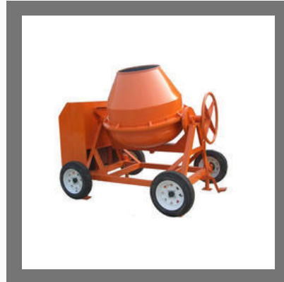
Tilting Drum Concrete Mixer