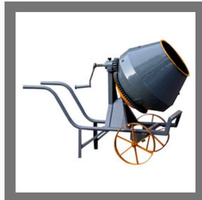
Hand Operated Concrete Mixer