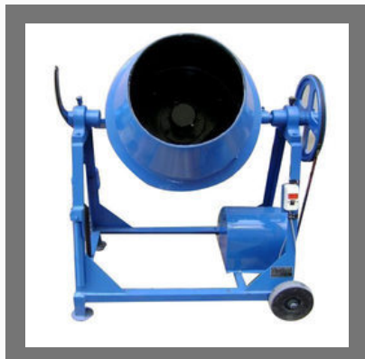
Laboratory Concrete Mixer