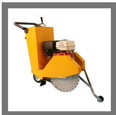
2 HP Concrete Cutter