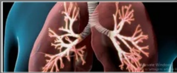
COPD Treatment Service