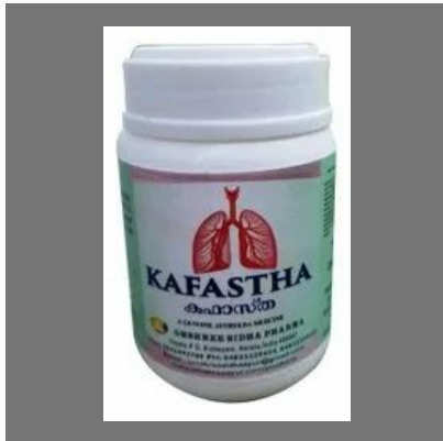
Kafastha Genuine Ayurvedic Medicine for Cough and Asthma