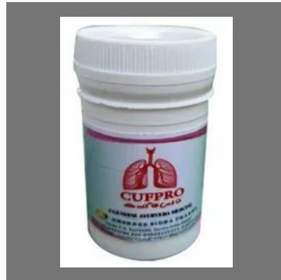
Cufpro Ayurvedic Medicine for Asthma Cough Allergy and post covid breathing difficulties