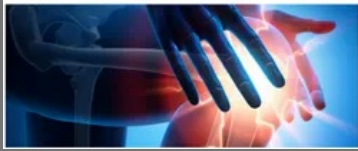
Osteoarthritis Treatment Service