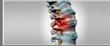
I.V.D.P Treatment Service