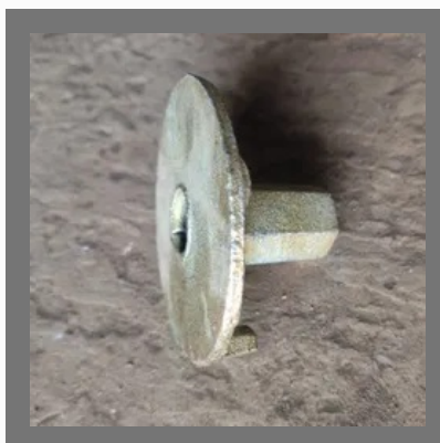
MS Anchor Nut