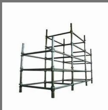
Scaffolding Cuplock System