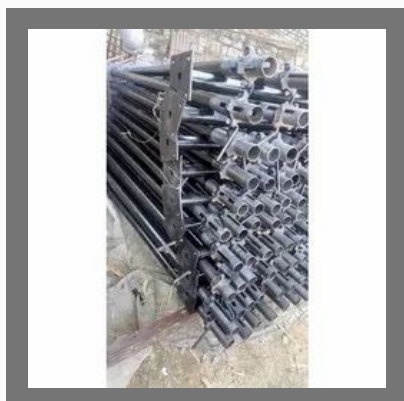
Scaffolding Props Jack