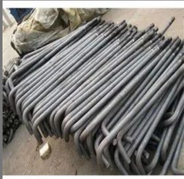
Mild Steel J Foundation Bolt