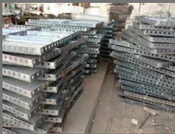
1000x1250mm Shuttering Plates