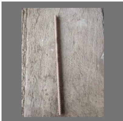
MS Tie Rod