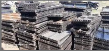
Mild Steel Shuttering Plate