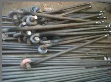
Rod Connecting Foundation Bolts