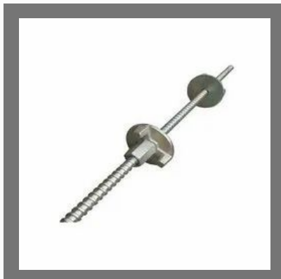
SS Construction Tie Rod