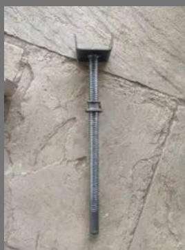
Solid Bar U Head Jack