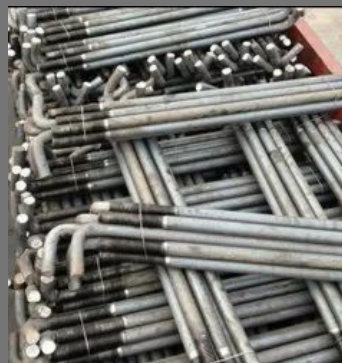
L Type Foundation Bolt