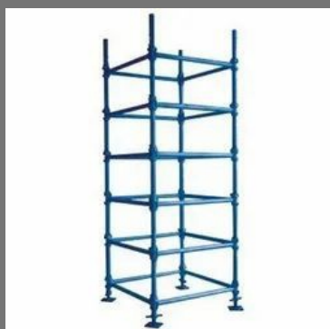
Mild Steel Scaffolding Cuplock System