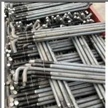
Hot Rolled Foundation Bolt