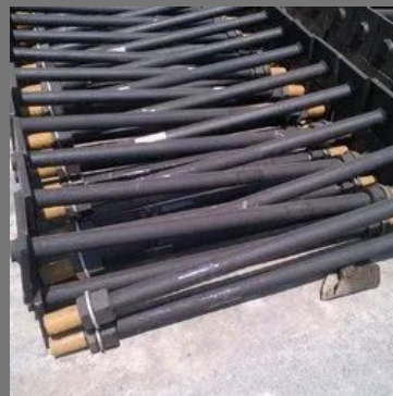
5 inch MS Foundation Bolt