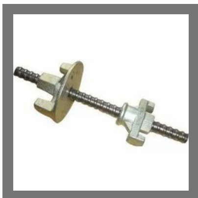
Mild Steel Scaffolding Tie Rod