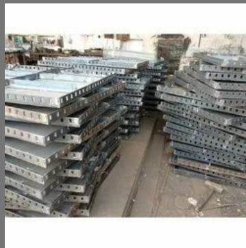
Rectangular Acro Shuttering Plates