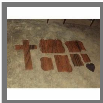
Granite Monument Cutting