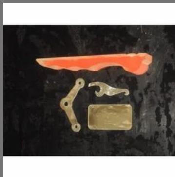
Steel Cutting Services