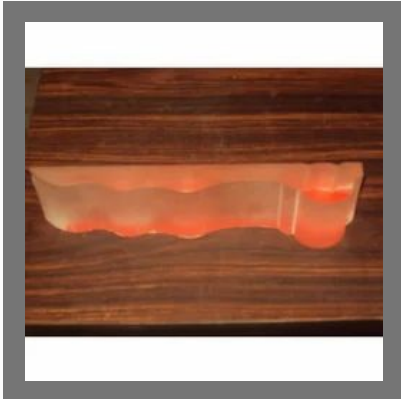
Crystal Design Glass Cutting Services