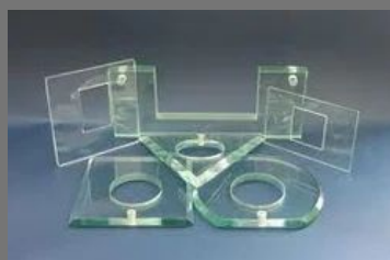
Glass Cutting Service