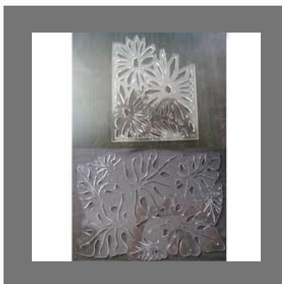
Acrylic Cutting Services