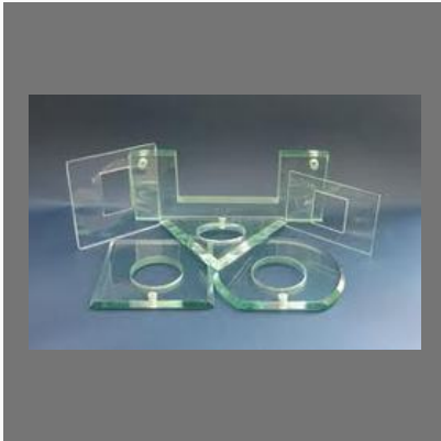
Glass Cutting Service