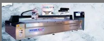
Hydrajet Waterjet Machine Services