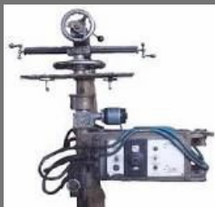
Profile Cutting Services