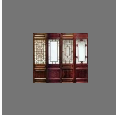
Marble CNC Designs