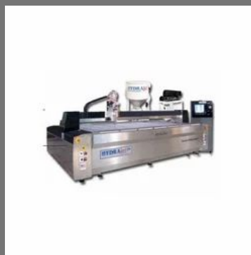
Waterjet Cutting Services