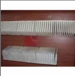
Aluminium Cutting Services