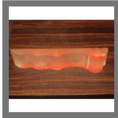
Crystal Design Glass Cutting Services