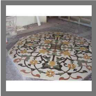
Marble Product Design Service