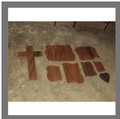
Granite Monument Cutting