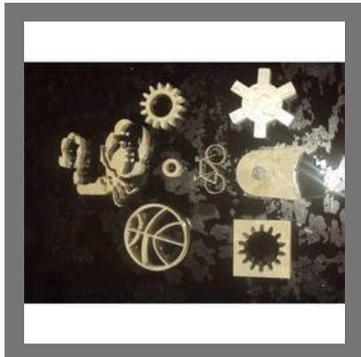
Stainless Steel Cutting Services