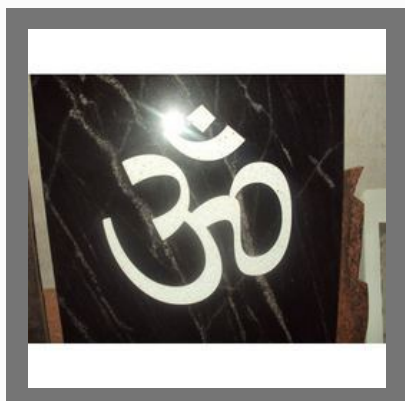
Granite Product Design