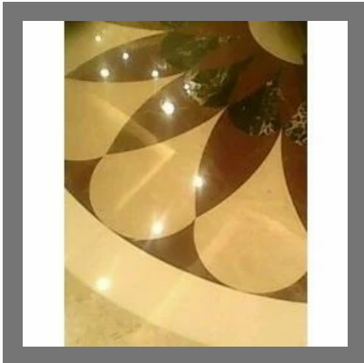
Marble Floor Inlay Cutting