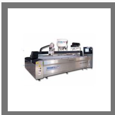
Waterjet Cutting Services