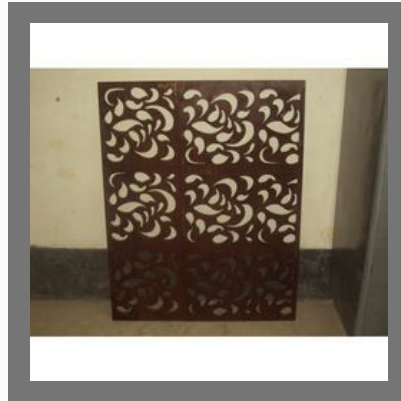
Wooden Grill Cutting Services