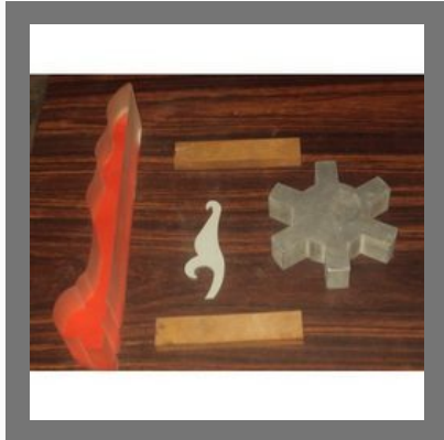
Copper Cutting Services