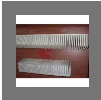
Aluminium Cutting Services