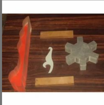
Copper Cutting Services