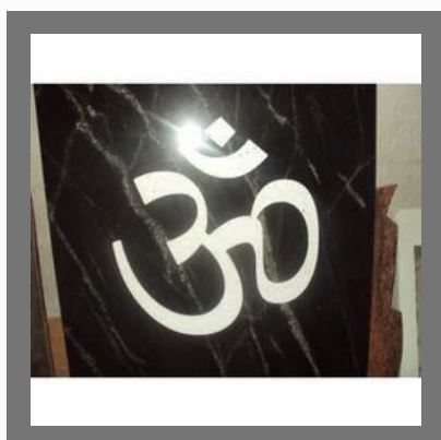
Granite Product Design