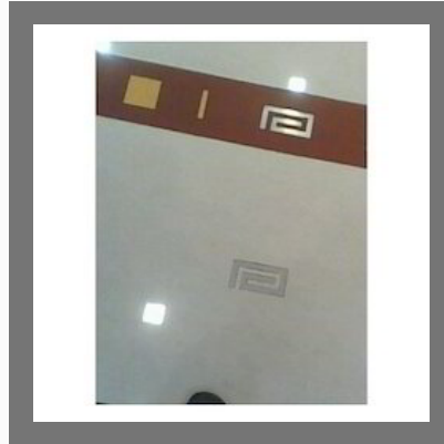
Marble Brass Inlay Cutting