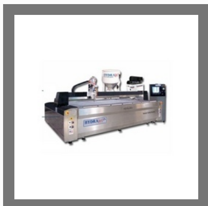
CNC Laser Cutting Service