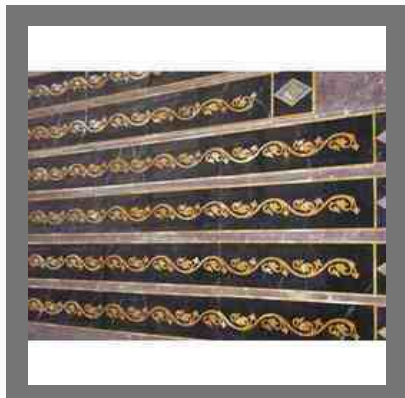
Marble Border Cutting