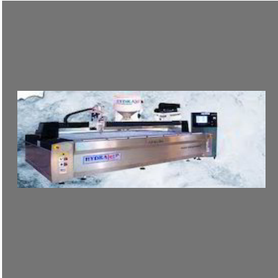
Hydrajet Waterjet Machine Services