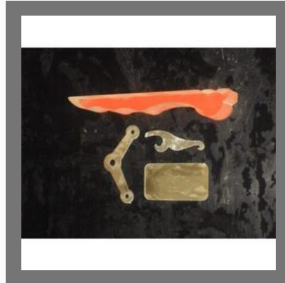
Steel Cutting Services