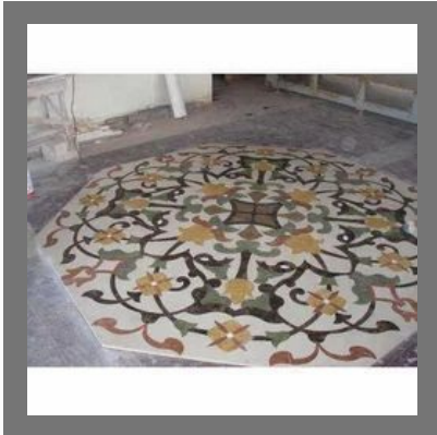
Marble Product Design Service