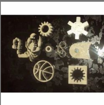
Stainless Steel Cutting Services