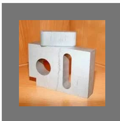
Aluminum Profile Cutting Services